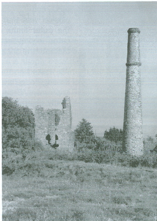
East Kit Hill Mine from north, 13 July 2005

IF YOU DID NOT RETURN YOUR FORM LAST YEAR ANOTHER IS ENCLOSED. THERE ARE ALSO FORMS FOR LIFE MEMBERS SINCE THEY MAY WISH TO MAKE A GIFT IN THE FUTURE.