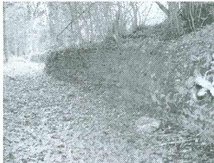
The wall at the foot of the valley slope running parallel to the stream past Jopes Cottage, February 2005

At the bottom of the valley slopes, on both sides, there are continuous, sinuous walls which we inspected. Along the Jopes Cottage southern boundary there used to be a mill leat, but no such feature would explain the wall on the other side of the stream. Also we thought that we had found signs of the leat on higher