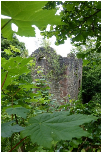
(Left) Skinners pumping engine house once contained a 40-inch cylinder beam engine made by the Bedford Foundry in Tavistock in 1864.

Extraction of copper, tin, arsenic and wolfram, and the crushing and primary dressing of ore were focussed on Skinners shaft, at 505m below ground one of the deepest in the area.