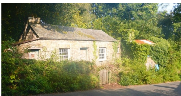
Miners' cottages, Lucketts, 4 September 2014